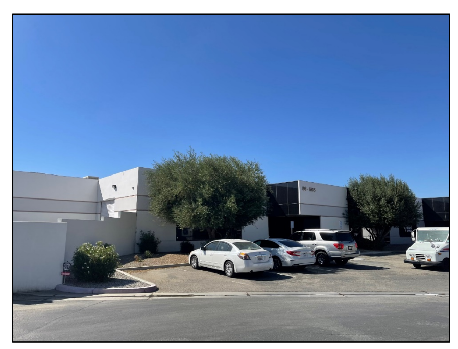
Industrial Building to the East of subject site