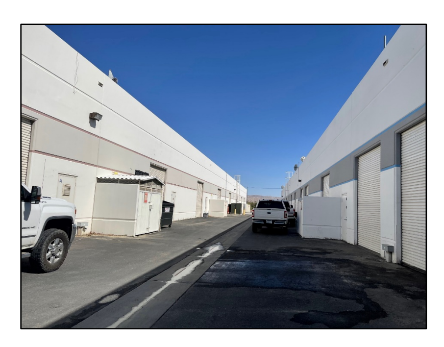
Rear Service Driveway