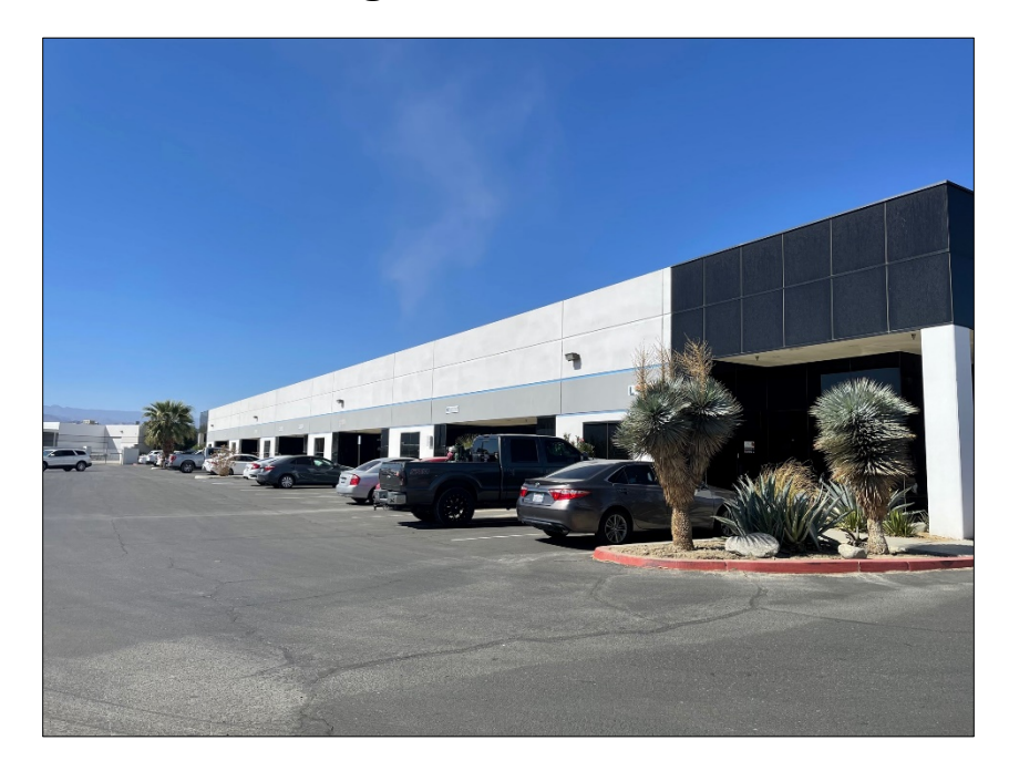
View of Existing Building and Parking lot looking West