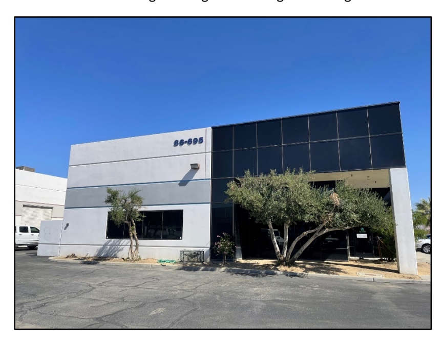
West Building Elevation